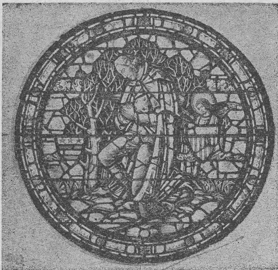
Portion of Rose in the Carillon Tower

Recently installed or under construction are the following: